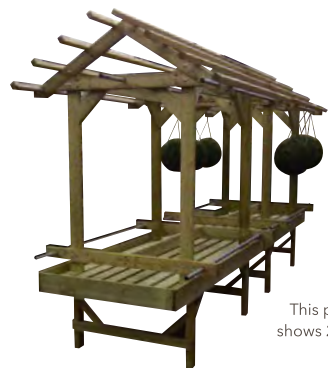
This picture shows 2 units

This unit is both flexible and versatile. It is designed to stand on a 2m x 1m bench allowing you to display your baskets and associated products on the same unit. Your baskets hang on galvanised rods from traditional 'S' hooks. Can be used inside or out.